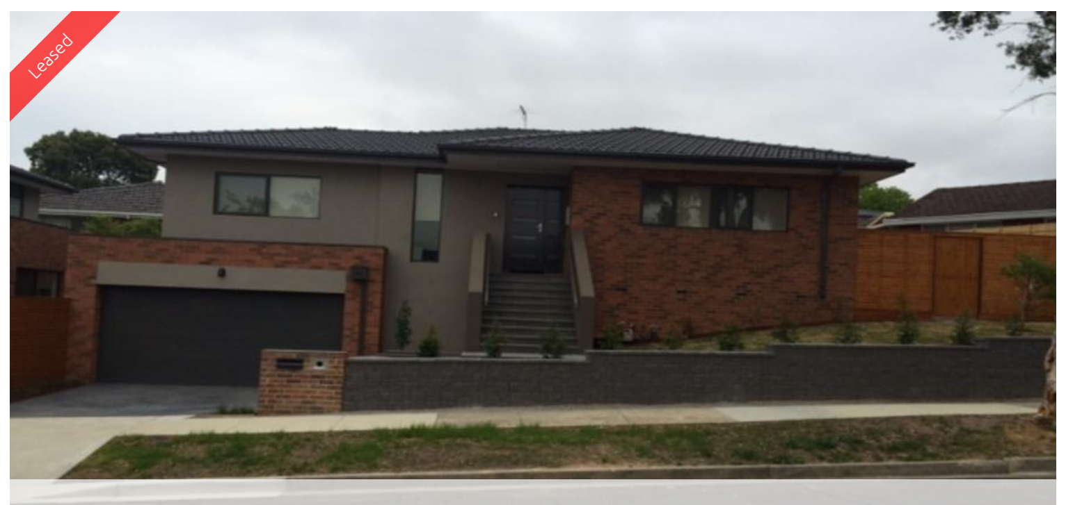
5 Lawrence St, Doncaster East