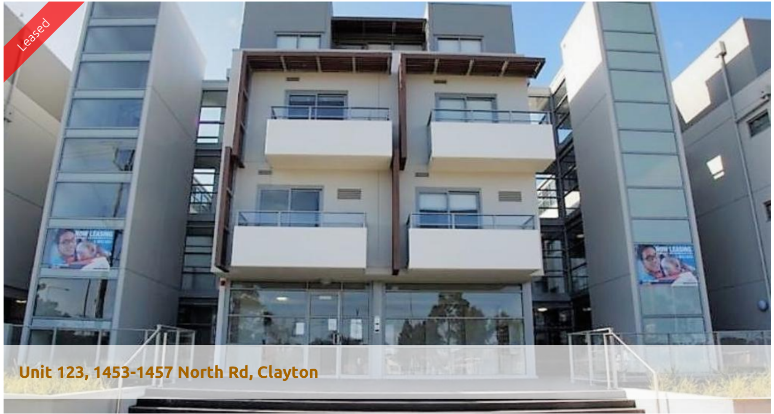
Unit 123, 1453-1457 North Rd, Clayton