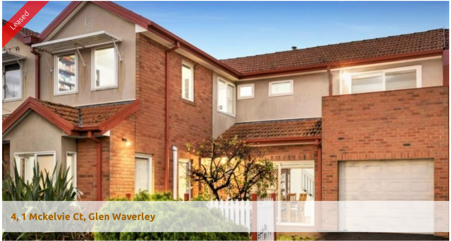
4, 1 Mckelvie Ct, Glen Waverley