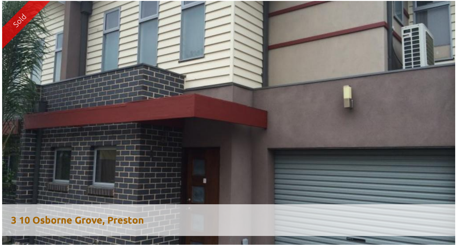
3 10 Osborne Grove, Preston