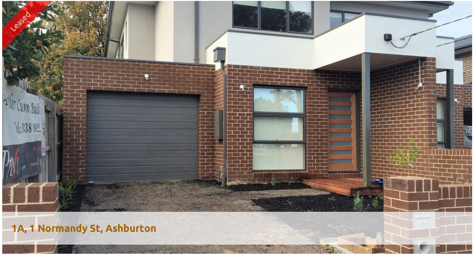
1A, 1 Normandy St, Ashburton