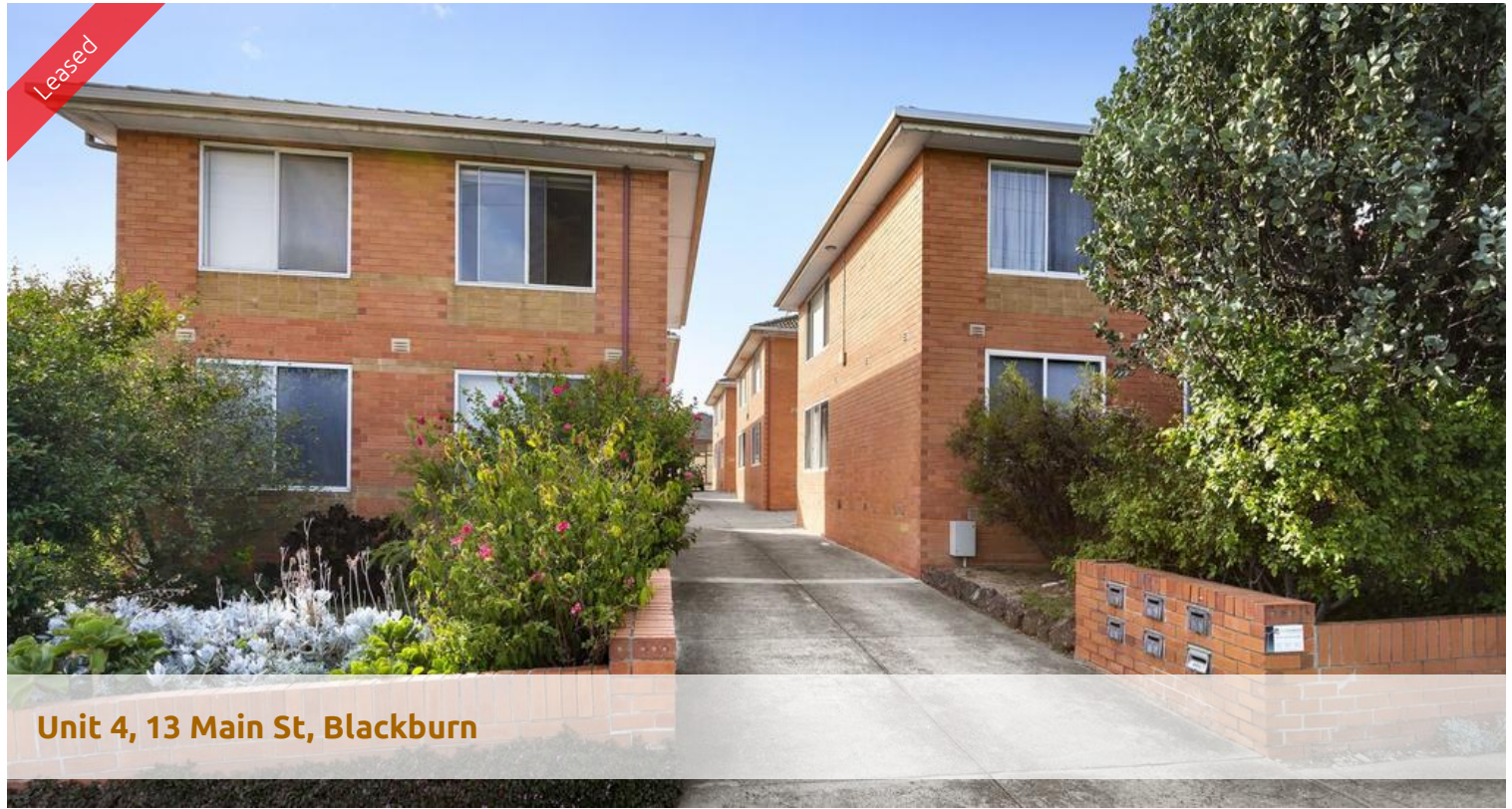
Unit 4, 13 Main St, Blackburn