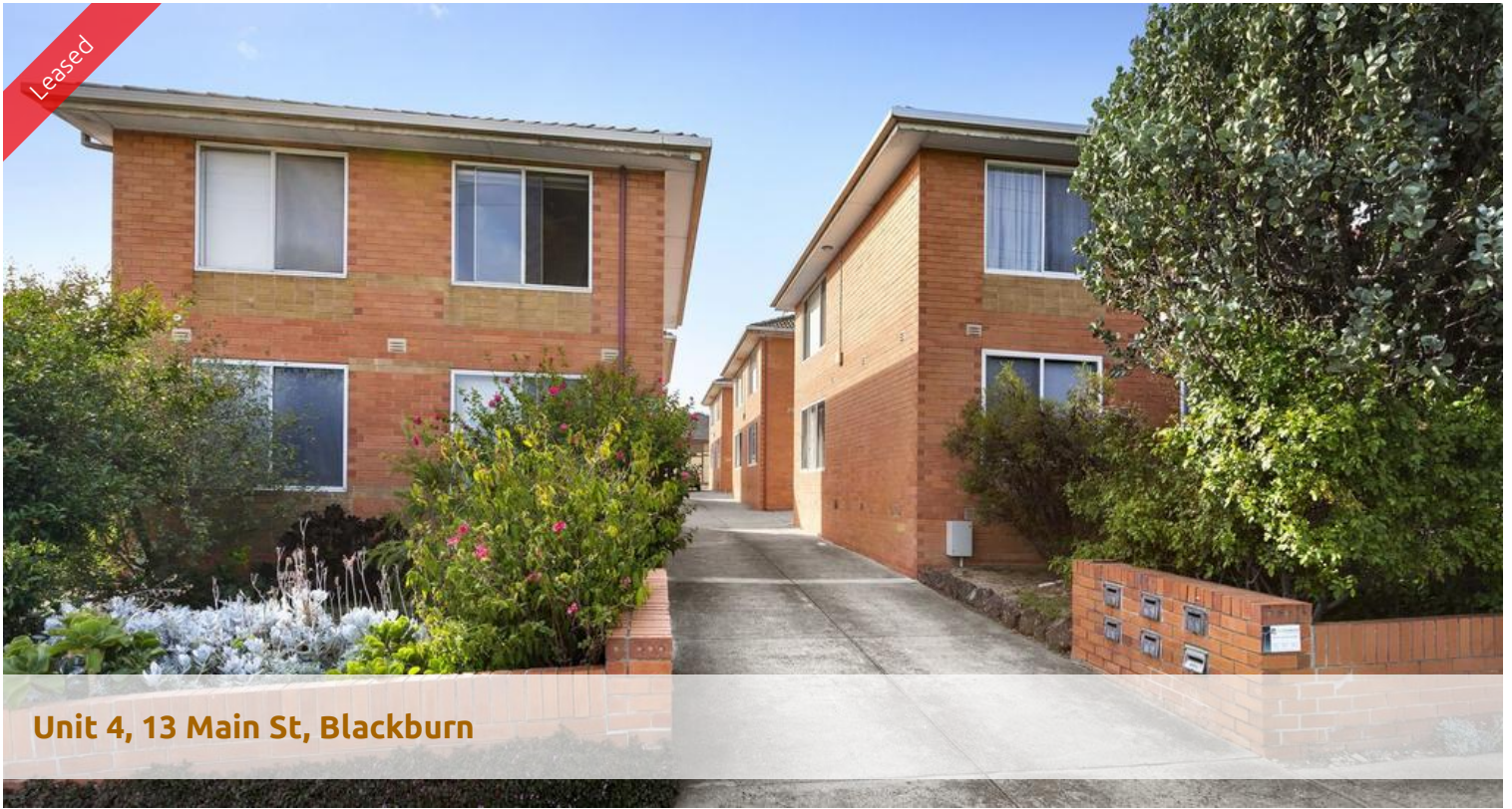
Unit 4, 13 Main St, Blackburn